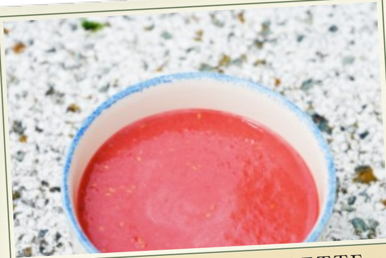
RASPBERRY VINAIGRETTE HOMEMADE